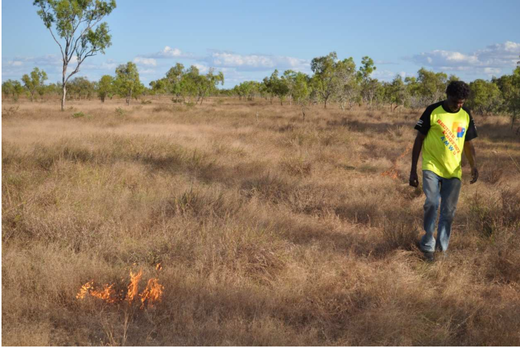
Figure 1: An Aboriginal man conducting early dry season burning in an ancestral estate area on coastal Ganggalida country, May 2012.

For Gammage and other scholars (Mcgregor et al. ; Russell-Smith et al. ), the ‘rekindling’ of pre-colonial Aboriginal burning practices like the wuurk (glossed as ‘bushfire’) tradition of western Arnhem land provides support for the normative claim that ‘we [i.e. non-Aboriginal Australians] have a continent to learn’. As Gammage puts it: ‘If we are to survive, let alone feel at home, we must begin to understand our country. If we succeed, one day we might become Australian’ ( The Biggest Estate on Earth 323).