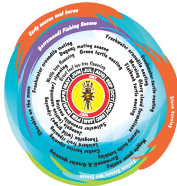
Figure 2: Traditional Seasonal Calendar, courtesy of the Carpentaria Land Council Aboriginal Corporation.

This funding led to the establishment of numerous land management programs, particularly those staffed by Aboriginal people with non-Aboriginal support such as the Ganggalida and Garawa Rangers employed by the Carpentaria Land Council Aboriginal Corporation on the Queensland side of the Gulf, and the Waanyi/Garawa Rangers employed by the Northern Land Council in the Northern Territory. One outcome of such work was the 2013 publication of a set of fire management guidelines for Queensland's Gulf country, which identifies thirteen 'fire landscapes' in the area and provides information about the distribution of each of these landscapes, their ideal burning 'mosaic', burn frequency and season (Carpentaria Land Council Aboriginal Corporation). 3 In addition, this laudable publication includes a seasonal calendar which provides information about Aboriginal resource use and traditional burning regimes (see Figure 2).