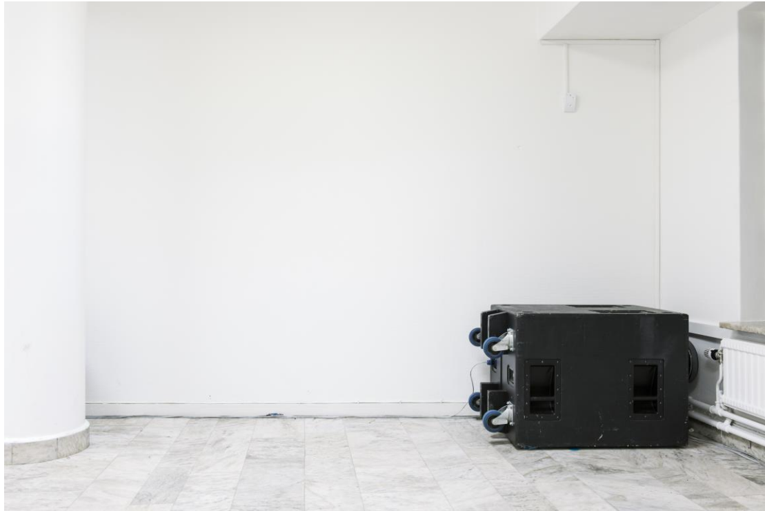
Figure 2. Christine Sun Kim, 4x4 , 2015. Sound installation. Installation view, Andquestionmark, 2015, Stockholm, Sweden. Courtesy of the artist and François Ghebaly Gallery. Photo: Sara Linderoth.

In 4 x 4 , the audience both sees and feels the effects of the vibrations. Davidson explains: