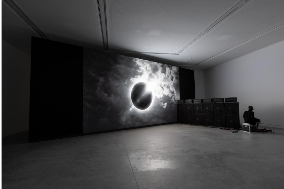
Figure 1. Marco Fusinato DESASTRES , 2022. Solo durational performance as installation 200 days. Installation view, Australia Pavilion, 59th International Art Exhibition of La Biennale di Venezia, 2022.

of the gallery environment. The presence of art visitors in the thousands are not heard within the gallery, and no conversations are audible above the tremendous volume of noise produced by Fusinato. The Australian Pavilion itself was quietened.